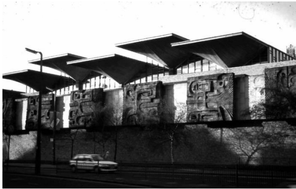
Fritz Steller, Articulation in Movement (1969).

A later development phase was the 1970 market hall, abounding in examples of public art. The pioneering canopy of the elegant market hall have been described in many terms; as 'sculptural', 'flowing', 'poetic', 'stunning', 'modernist interpretation of Gothic', 'cathedral-like', 'dull concrete', 'dismal', 'greying concrete'. 7 The project architect Gwyn Roberts (1936-2004), of the Seymour Harris Partnership) wanted to have an interesting roof structure which would return to the traditional concept of the market place with rough wooden stalls shaded but not enclosed by a canopy. From the interior the roof scape is indeed poetic; the twenty-one freestanding roof shells are more decorative than practical; sculptural, asymmetric, carefully parallel board-marked and well lit. The Queensgate façade of the market hall displays five roof shells. Beneath, against the outside wall are nineteen shop units that vary in depth alternately, so that from the outside the first floor is indented delineating each trading space emphasised by ceramic panels by Fritz Steller (b. 1941) of Square One Design. The nine relief panels (18ft x 18ft) are presented proudly between smooth ashlar stone. The panels continue across the façade, nine panels with ten ashlar intervals. Much of it is now hidden by trees that have outgrown their place in the scheme.