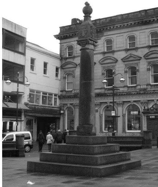
Huddersfield Market Cross.

In the market place, at the heart of the town is a market cross. It may well be the oldest visible part of the town, dating from about 1671 when the Ramsden family acquired a market charter. Is it art? It was a symbol of authority, it marked the centre of market franchise rights for a radius of 6\frac{2}{3} miles. The cross can also be decoded as such; its structure representing social order. It is topped with a stone orb representing monarchic supremacy, beneath that is a cube depicting Ramsden armorial bearings indicating the marriages with other landed families; this is borne high above us by an orderly decorated circular stone column with an Ionic capital, literally keeping the hierarchy in an elevated position. At the foot are plain steps spreading out, the lower orders taking the strain of all above.