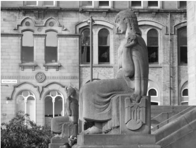
Youth Awaiting Inspiration (1939) outside Huddersfield Art Gallery.

A rather more light-hearted approach to didactic architectural decoration was taken by E. H. Ashburner (1896-1992), the architect of Huddersfield's 1930s Art Gallery and Library. In 1946 Ashburner was to write: