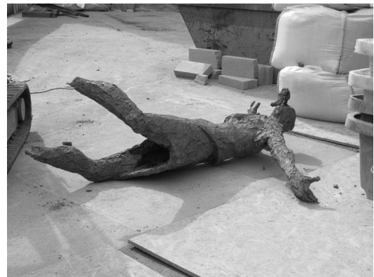
Left and right: Peter Peri, Welcome (1961).

In the early 1960s Huddersfield Corporation remodelled the girls Grammar School, Greenhead High School, with the Ministry of Education's own design unit as a case study. This included adding 'beauty' by commissioning art for the school. 5 The major work was by Peter Peri (1899-1967), a Hungarian Jewish émigré sculptor whose figurative work was commissioned by several education authorities. For Greenhead he produced, in-situ, Welcome (1961). Until 2012, when it was cut down by the then Greenhead College during remodelling, it was a life-sized, pony-tailed girl whose raised arms were spread out wide. The figure cantilevered overhead, from her soles, out of the school's first storey at about 30 degrees from the upright.